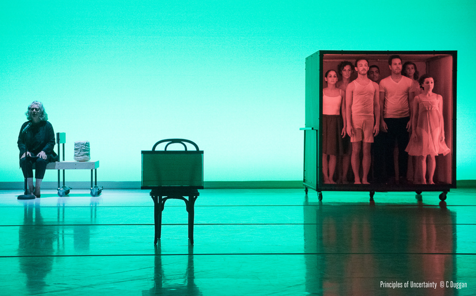
Principles of Uncertainty © C Duggan