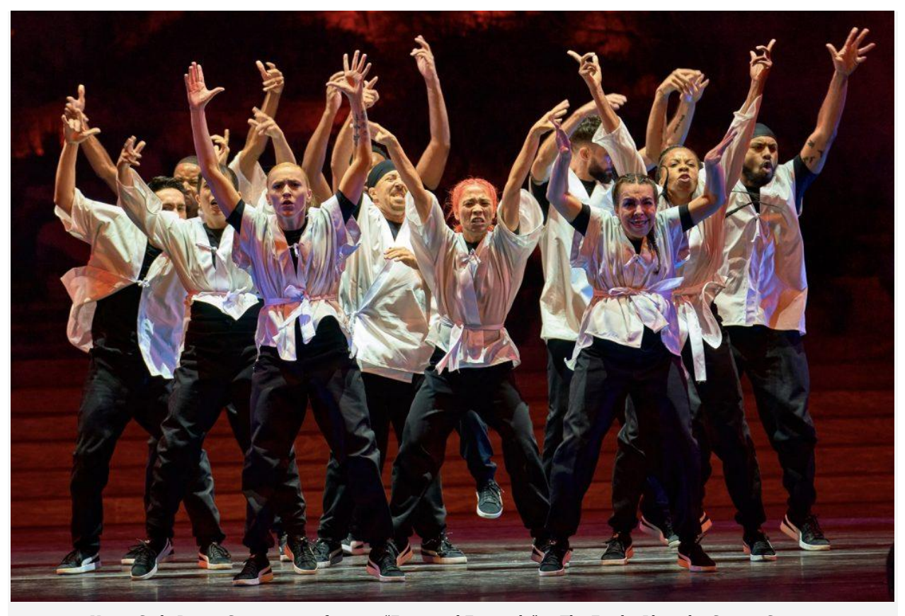
Versa-Style Dance Company performing "Freemind Freestyle" at The Ford The final group finale was driven by drum filled music score that literally had some audience members dancing in their seats and into the aisles. This music awoke a primal core in everyone within earshot. Freemind Freestyle was yet another hit for Versa-Style Dance Company!