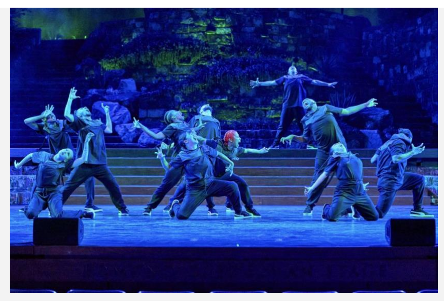
Versa-Style Dance Company Performing "Freemind Freestyle" at The Ford Hands appearing to hold a mirror as dancers looked at them, which brought about popping style movement, pain, anguish and even death. The subject was crystal clear although the movement was abstract, static, and traversing between all-out Hip Hop dancing to somber reflections on the words spoken by Kane Smego, to abrupt and complete stops.